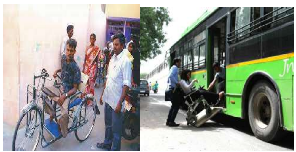
Hand operated tricycle Person entering in bus with wheelchair

Volume 3, Issue 7 July 2021, pp: 2418-2422 www.ijaem.net ISSN: 2395-5252