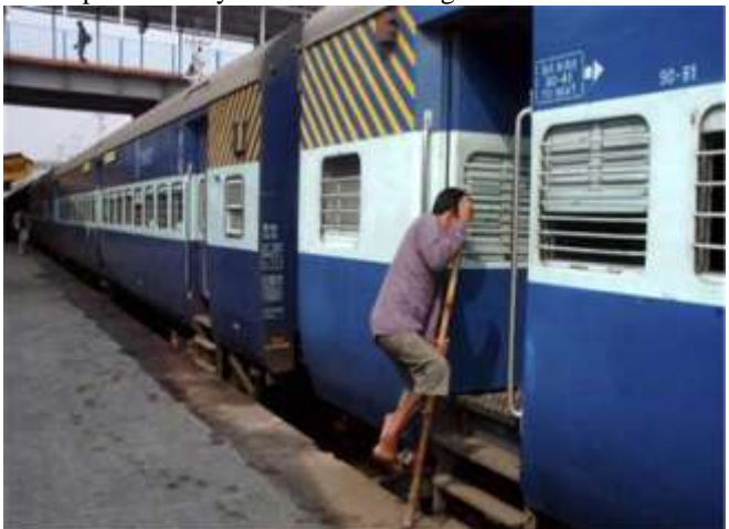
Person entering in train with bamboo stick